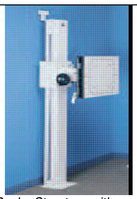
Tilting Bucky Structure with gear-driven adjustment, ideal for upper cervical images.

the increased power output of HCMI high-frequency generators. Also standard on the DC-1 is a full-length, Vertical Frame designed exclusively for chiropractic imaging to allow the heavy-duty 17" film cabinet to travel without contacting the patient. Complete spinal imaging is easily performed without repositioning the patient. A 10:1 ratio, fine line grid and heavy-duty cassette tray are included as standard for the optimal in image quality. Examples of popular options to the DC-1 include: