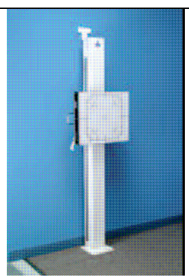
Conventional Vertical Structures for 17" x 17" or 14" x 36" film cabinets.