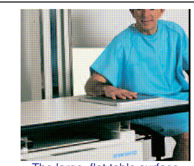
The large, flat table surface provides images without distortion.