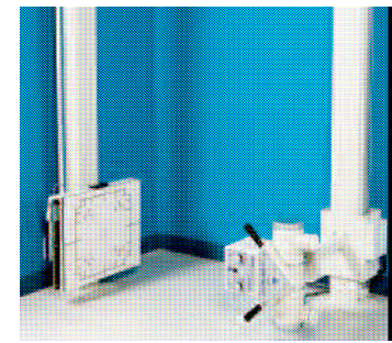
The extensive tubestand travel allows easy weight-bearing exams.